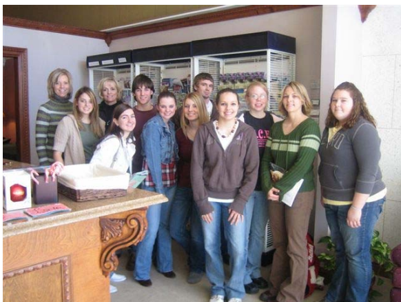
LIBERAL HIGH SCHOOL DAY AT THE CHAMBER