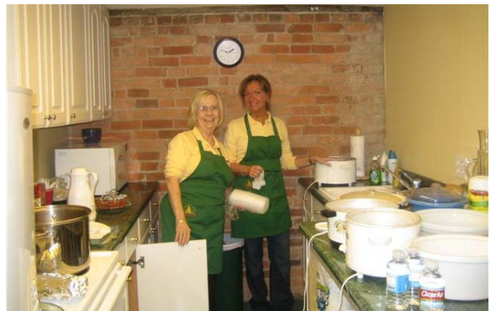
CHILI & BAKED POTATO AT THE CHAMBER